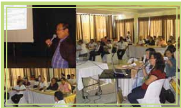
The IAS Department Manager on his presentation of the IAS Mission and Vision during the Exit Conference at General Santos City Region 12 on October 12, 2010

Maintained close coordination with Department of Budget and Management on matters related to organization and management.