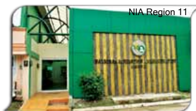
NIA Region 11