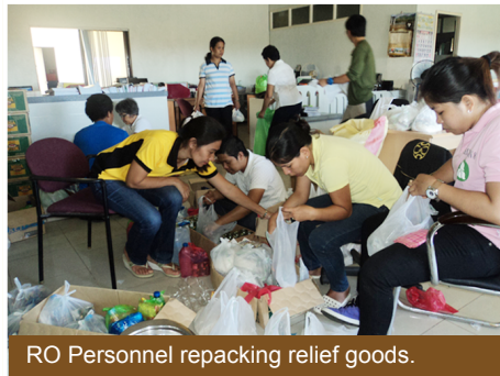
RO Personnel repacking relief goods.