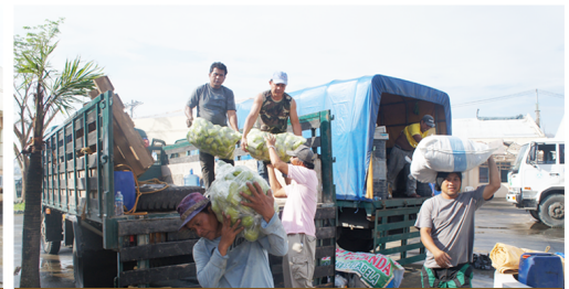
Unloading of relief goods.