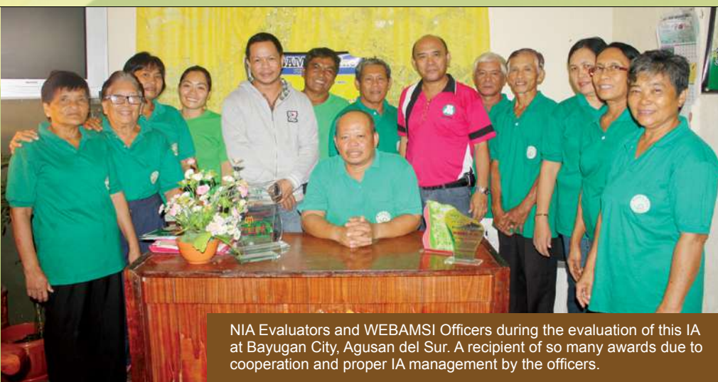
NIA Evaluators and WEBAMSI Officers during the evaluation of this IA at Bayugan City, Agusan del Sur. A recipient of so many awards due to cooperation and proper IA management by the officers.

Awareness of our environment is the first step on being prepared. The little things that we do to conserve our environment, may eventually prevent calamities, if not, may prepare us for one. In any situation being prepared spells the difference between life and death.