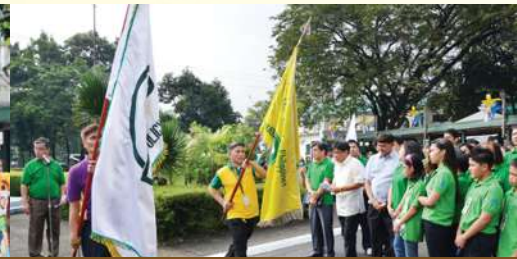
NIA joins DA family during the opening of the WFD celebration at DA Grounds, Diliman, Quezon City