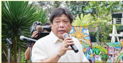
Agriculture Secretary Proceso J. Alcala leads the event stressing out "hindi sapat na ang bawat mamamayan ay busog, dapat ay malusog."

Undeterred by continuous rain, NIA employees and other DA-attached bureaus and agencies joined in the celebration of the 2013 World Food Day (WFD) with the theme "Sustainable Food Systems for Food Security and Nutrition" October 14-16, 2013 at the DA Grounds and Liwasang Aurora, Quezon Memorial Circle.