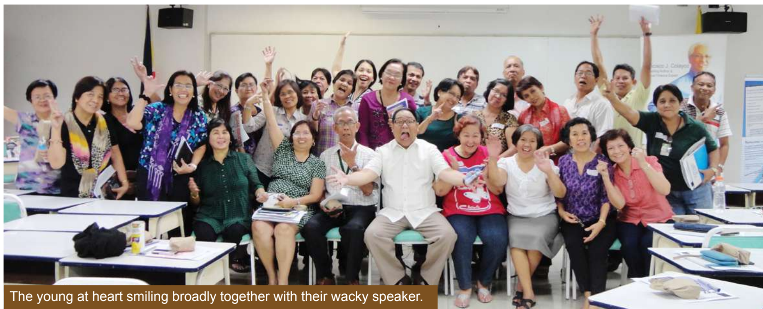
The young at heart smiling broadly together with their wacky speaker.