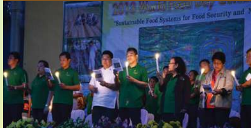
The highlight of the evening – FAO and DA led the lighting of the candles and the recitation of the pledge to protect healthy food systems.