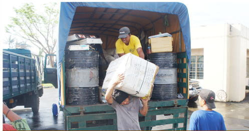
The relief goods coming from Central Office and from the different regions of NIA.