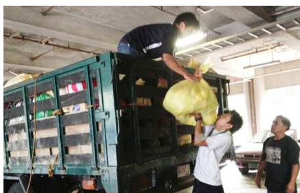
Volunteers load relief goods to one of the stake trucks leaving for Tacloban City.