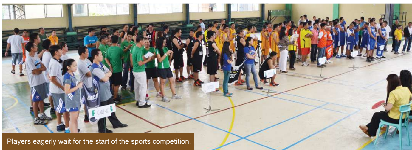
Players eagerly wait for the start of the sports competition.

The Central office Sports fest is usually held during the summer months but it was adjusted to November to pave the way for the grand preparations for the agency's 50th golden anniversary.