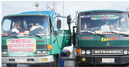
The two stake trucks from MARIIS, Isabela were used in transporting their relief goods for victims of YOLANDA