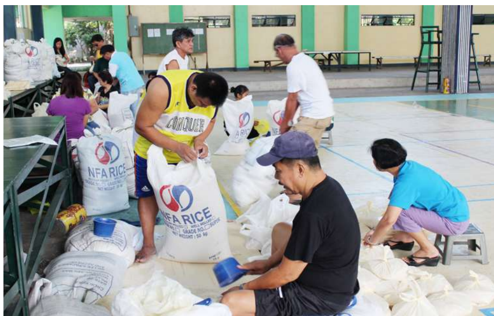
The rage of Typhoon Yolanda stirred the hearts of NIAns and their families to share their time and efforts repacking NFA rice.

1 Peter 3:8 Finally, all of you, be like-minded, be sympathetic, love one another, be compassionate and humble.