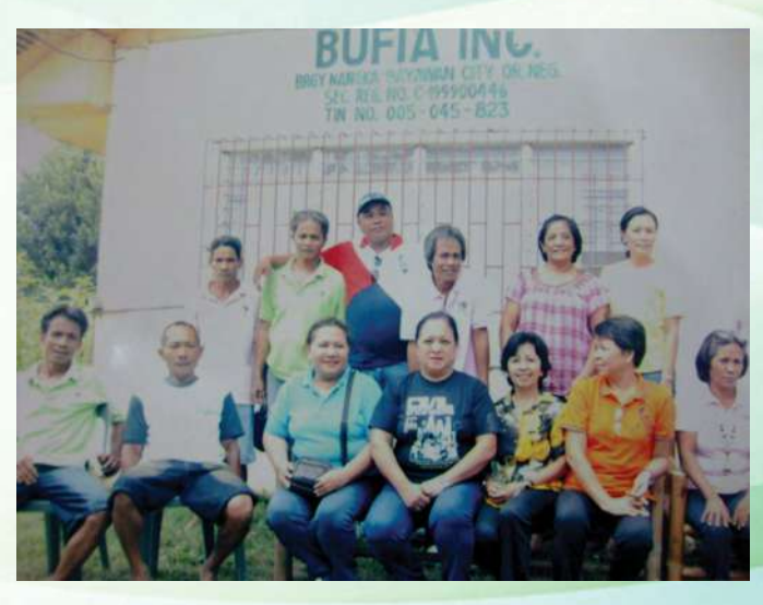
BUFIA's Board of Trustees

attracted to be a part of the fast growing, developing and service oriented BUFIA.