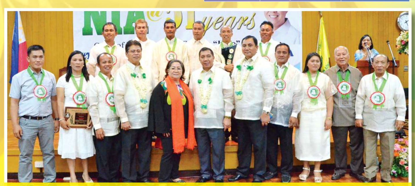
NIA Top Management with the 2013 Most Outstanding IAs (NIS, CIS, and CARP) during the 51st Anniversary Awarding Ceremony