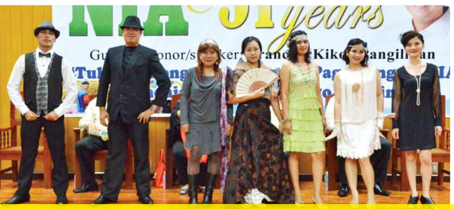
Finance Sector's Fashion Show participants inspired by the elegant 1920s.