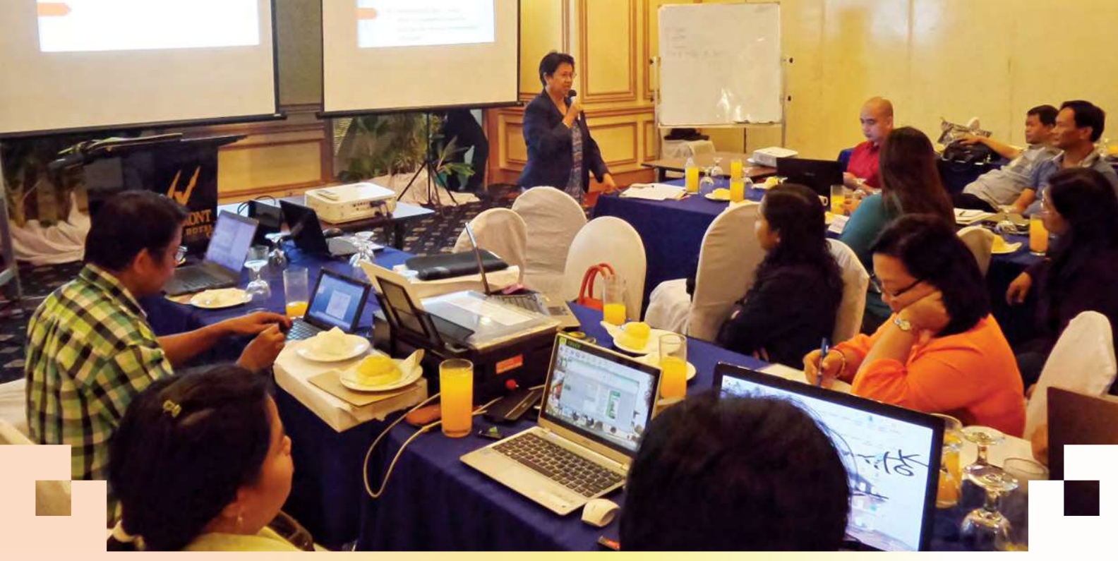
In order to accommodate the request, the Central Office HRD and PMT arranged the seminar-workshop entitled "NIA Strategic Planning and Management: Aligning and Cascading to Offices and Regions the SPMS" on the following dates and venues: