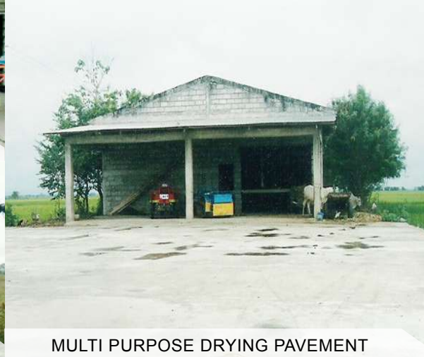
MULTI PURPOSE DRYING PAVEMENT