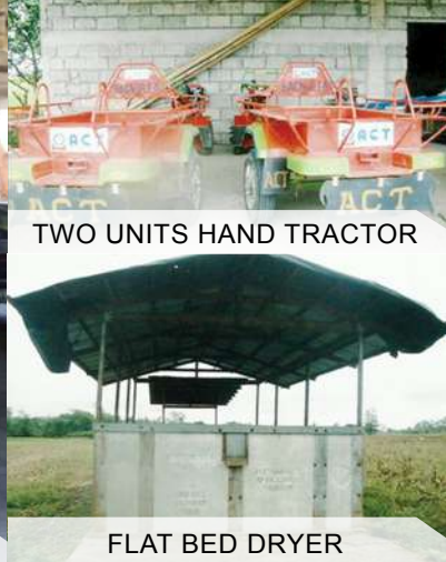
TWO UNITS HAND TRACTOR