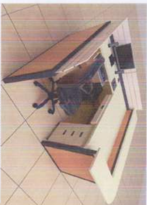
DATA ENCODER WORKSTATION - ENGINEERING DEPARTMENT