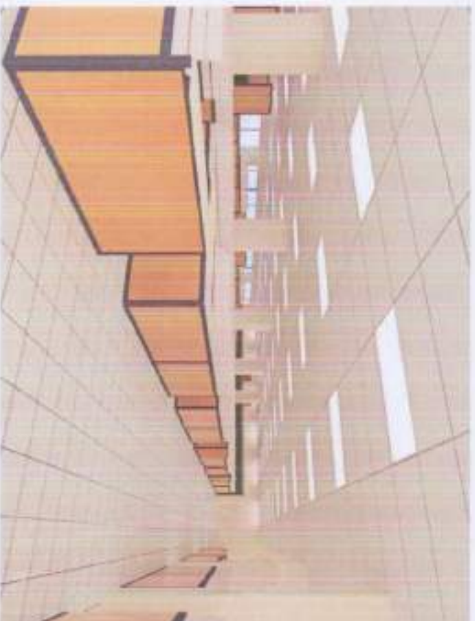
PROJECT PLANNING DIVISION - ENGINEERING DEPARTMENT