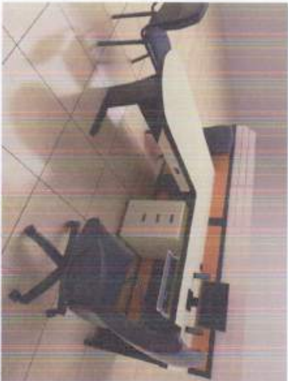
SECTION HEAD WORKSTATION - ENGINEERING DEPARTMENT