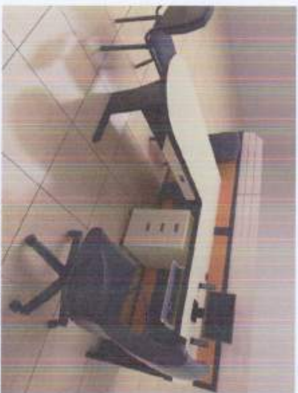
SECTION HEAD WORKSTATION - ENGINEERING DEPARTMENT