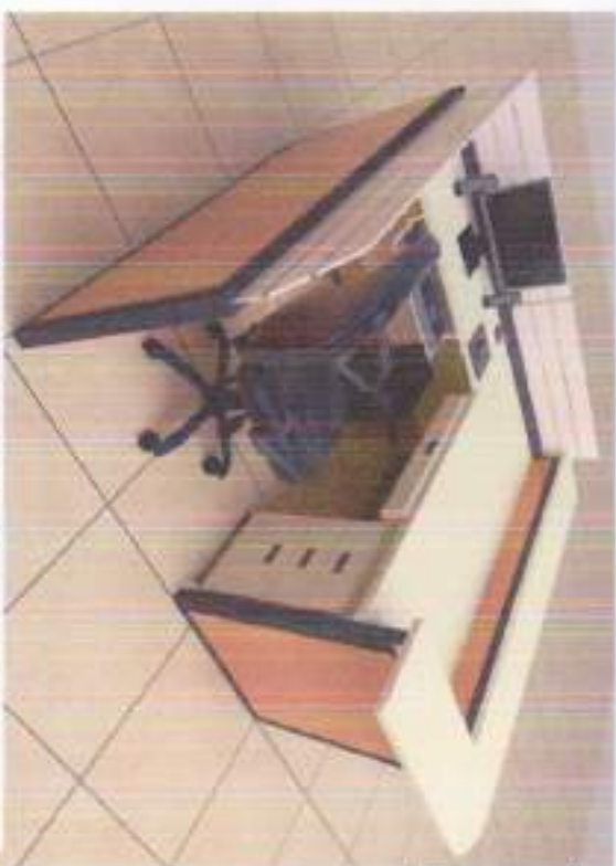
DATA ENCODER WORKSTATION - ENGINEERING DEPARTMENT