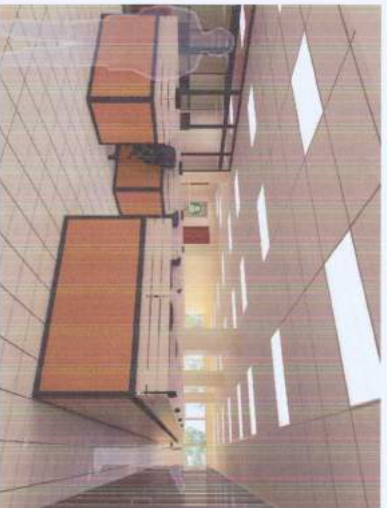
BUDGET AND REVENUE DIVISION - FINANCIAL MANAGEMENT DEPARTMENT