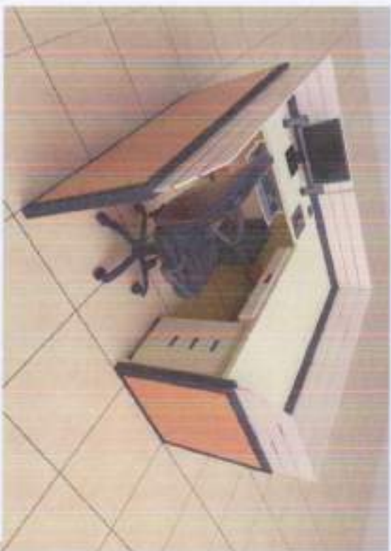
TYPICAL WORKSTATION - ENGINEERING DEPARTMENT