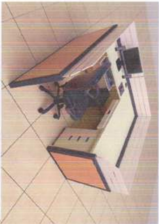
TYPICAL WORKSTATION - ENGINEERING DEPARTMENT